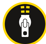
BRASS YKK ZIP LIFETIME WARRANTY