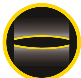
INTERNAL KNEEPAD POCKET