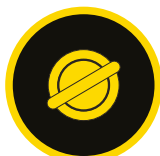
NON-SCRATCH HEAVY DUTY FIXING STUDS