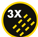
TRIPLE STITCHED SEAMS