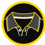
TAPED NECKLINE FOR COMFORT