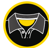
HALF MOON YOKE